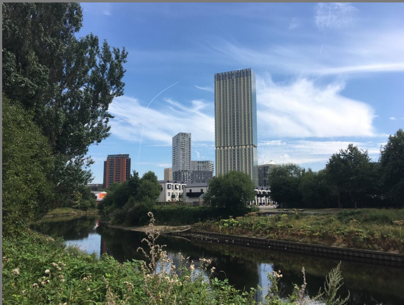
View of Irwell Riverside